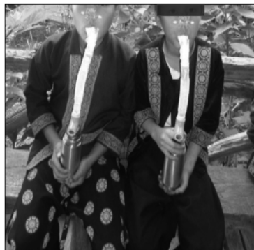
Figure 2. Collection of EBC samples using the developed device.

to form a complete seal around the mouthpiece and maintain a dry mouth during collection by periodically swallowing excess saliva. The subjects sat comfortably and wore nose clips. They were instructed to breathe normally and expire very slowly through the mouthpiece; this continued for 10 minutes to collect condensate of about 1.2 mL per subject. The collected EBC samples were immediately stored at -70^{\circ}\text{C} until analysis.