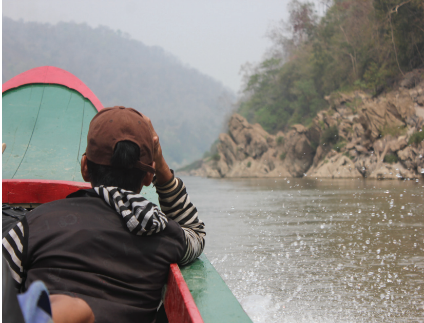
Figure 2. Young people in particular regularly travel to and from Thailand and stay well-informed on political developments across the border.