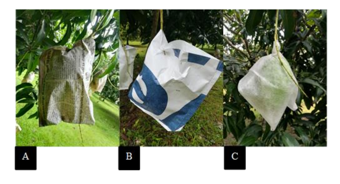
Figure 1. The three bagging materials namely: old newspaper (A), spun-bond high density polyethylene (SHDPE) (DuPont<sup>™</sup> Tyvek<sup>®</sup> Homewrap) (B) and non-woven spun-bond polypropylene (NSPP) or fleece (C).

At the farm, from three mango trees, a total of 100 randomly selected mango fruit were identified for each bagging material. Each mango tree had samples for each of the bagging materials. Each treatment was replicated three times using three trees. Visual quality and preharvest quality defects were observed at harvest from 50 randomly selected fruit from each bagging material. Preharvest quality defects observed in the harvested mango fruit included insect pest, scab, sooty mold, lenticel spotting, skin browning, growth cracks, wind scar, and undersized fruit. Preharvest quality defects of fruit were evaluated according to the most distinct and prominent preharvest quality defect from the 50 randomly selected fruit per bagging material.