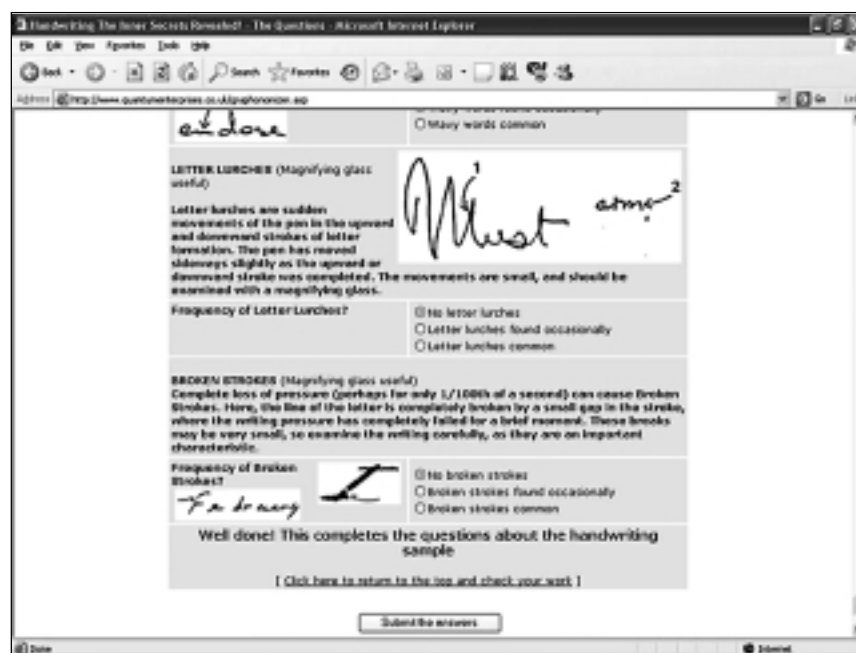
Figure 2. Screen Shot of Andy Hunt's Graphonomizer.

Upon completion, users have to click the 'Submit' button and the analysis report will appear on the computer screen. The report is a complete analysis which contains about 500 to 1200 words, depending on the number of characteristics shown in the handwriting and a personality chart with scores for eight major personality traits. The handwriting analysis system was rated 76.2% accurate by its users. Figure 2 shows the screen shot of the Andy Hunt's Graphonomizer.