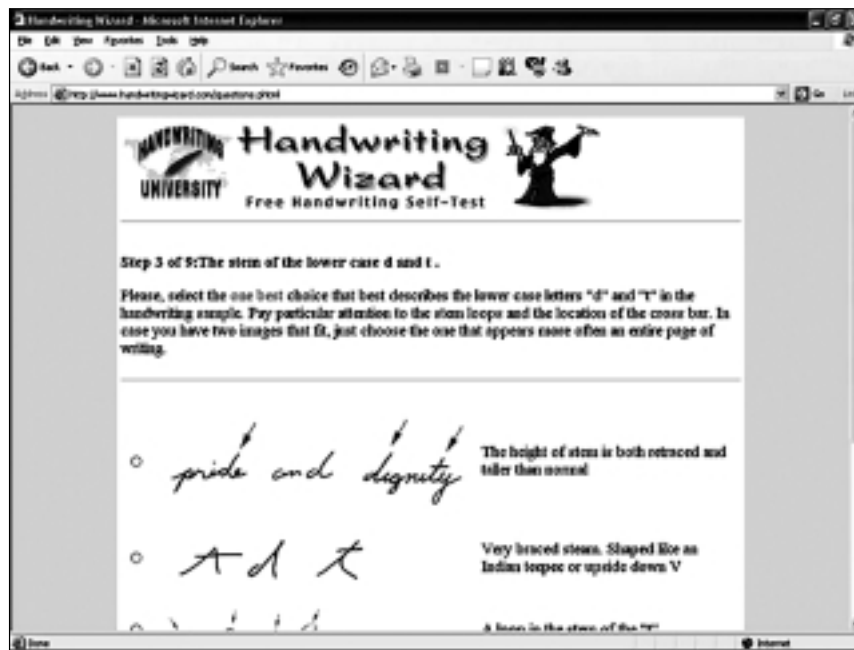
Figure 3. Screen Shot of Handwriting University's Handwriting Wizard.

Handwriting Wizard consists of nine handwriting characteristics. Each characteristic represents handwriting's uniqueness and element. Table 1 shows the nine characteristics of the Handwriting Wizard.